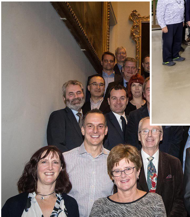
Anti-Doping Norway's 20 Year Anniversary Seminar,